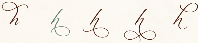
SS05 SS06 SS07 SS08 SS09