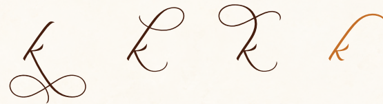
SS08 SS09 SS10 SALT