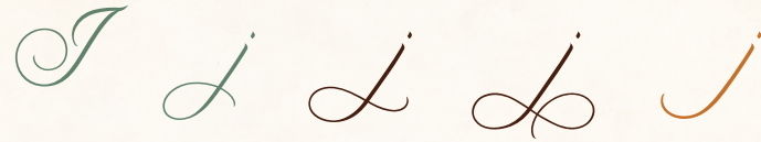
SWSH SS06 SS07 SS08 SALT