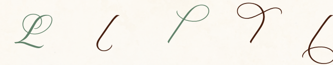
SWSH SS01 SS04 SS05 SS06