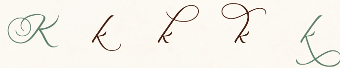
SWSH SS01 SS04 SS05 SS07